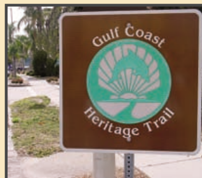
Look for road signs like these to guide you along the Gulf Coast Heritage Trail.

The continued restoration of Sarasota Bay includes the removal of such exotic species as Australian Pine (seen here) that infest our coastal systems and alter the beauty and productivity of native habitats.