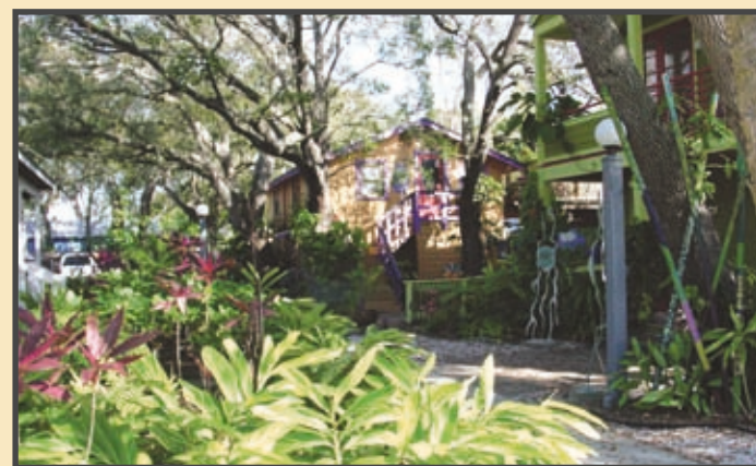
Towles Court is an artist colony in downtown Sarasota, site #77 on the Gulf Coast Heritage Trail.

The Sarasota Bay Estuary Program continues to make progress in its efforts in Manatee and Sarasota counties to restore Sarasota Bay, our area's greatest natural treasure.