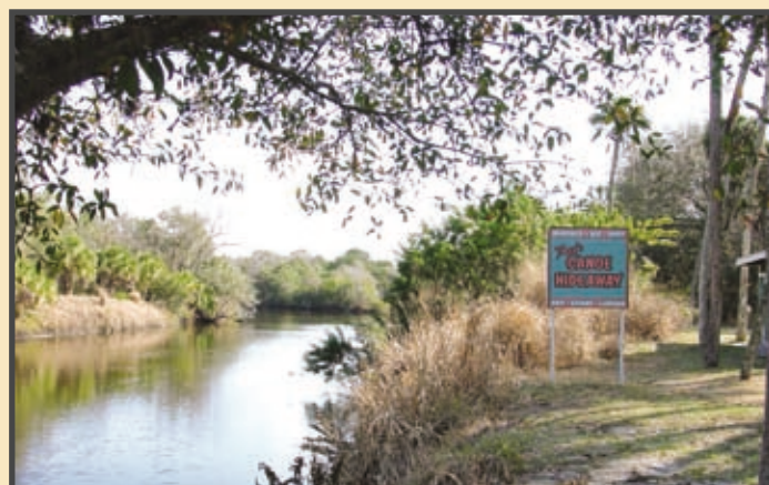
Ray's Canoe Hideaway located on the Upper Manatee River, site #10 on the Gulf Coast Heritage Trail.