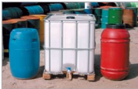
Some common containers used for rain barrels are (left to right): 50-gallon sealed barrel, 275-gallon juice container, 50-gallon open-top barrel.