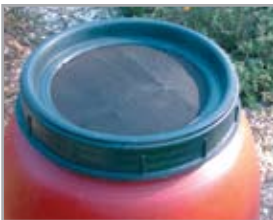
A barrel covered with window screen can be placed under a roof valley to collect rainwater runoff.

Elevating the rain barrel on a platform, such as cinder blocks, will give additional water pressure and will provide clearance for connecting a hose or filling a watering can.