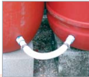
Connecting rain barrels together will allow for more water collection.