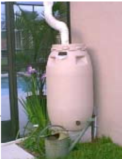
This barrel was painted to match the house color.

Outdoor acrylics and spray paint work well, but the barrel must first be primed so these materials adhere properly to the surface. A product on the market is a spray paint designed specifically for outdoor plastic furniture, but it will work on almost any plastic surface. The benefit to this product is that the barrel does not have to be primed before applying the spray paint. If using spray paint but need to paint small details, spray some paint into a small cup, making a liquid puddle. This paint can be brushed on.