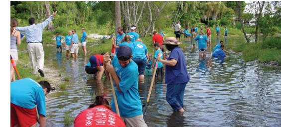
Citizen participation in restoring and protecting Sarasota Bay and its tributaries is critical.

For more information about becoming involved in the restoration of Sarasota Bay please visit our website at www.sarasotabay.org